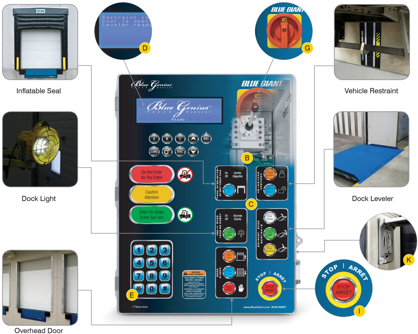
Blue Genius™ Platinum Series panel shown.