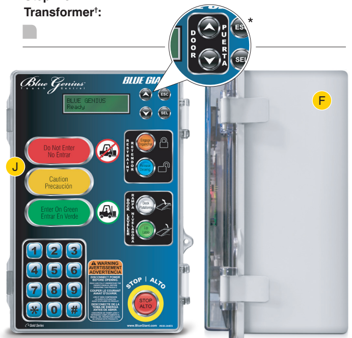
Blue Genius™ Gold Series III panel shown.