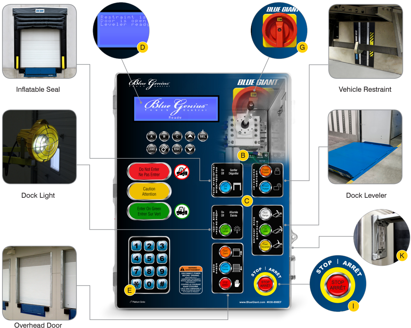
Blue Genius™ Platinum Series panel shown.