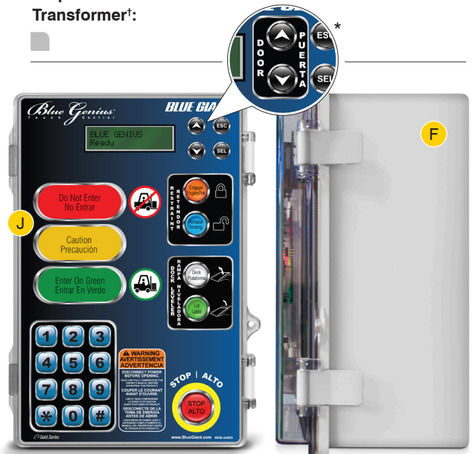
Blue Genius™ Gold Series III panel shown.