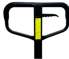
Comfort grip and easy access controls.