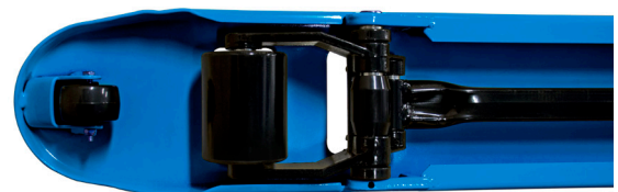
Entry / Exit Rollers