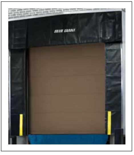
BGDSHS Stationary Dock Shelter