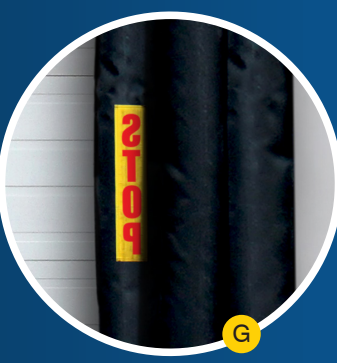
High visibility reverse 'STOP" logo